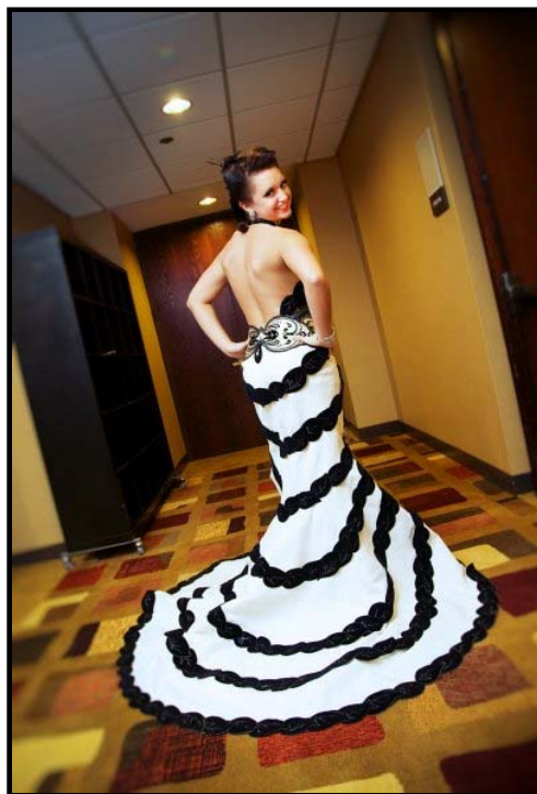
Product Runway 09