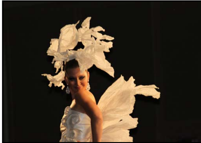
Interior Design Boston (IDB) Fashion Show New England Chapter Best Construction: Gensler

Sneak Peek is a new section of DesignMatters featuring photos from IIDA Chapter events nationwide. If you're interested in having your photo included in the next DesignMatters , please contact Carmen O'Donnell . Enjoy!