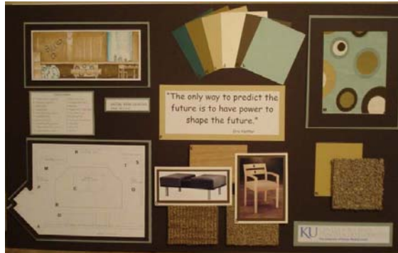
JCCC Project Board

The Center for Child Health and Development at Kansas University Medical Center is an office that observes and diagnose children who have mental development disabilities. The Medical Center wanted to update and give their center a fresh look while creating a space to soothe children as they wait for the physician. A small group of designers set out to collaborate and achieve these goals.